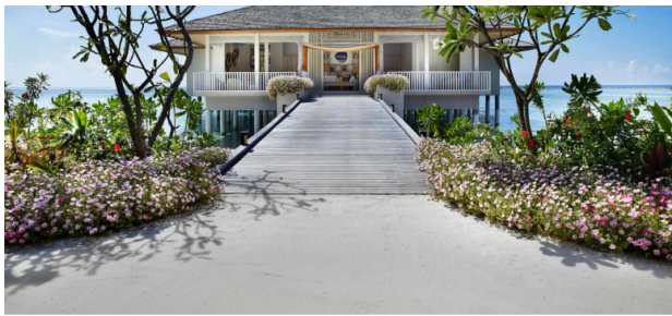
The spa at Le Meridien Maldives Resort and Spa