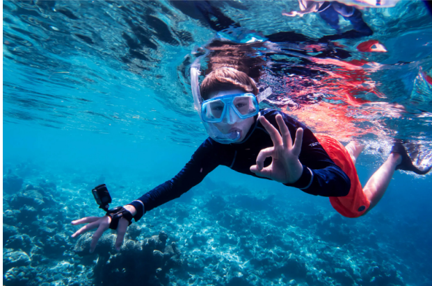
Six Senses Laamu