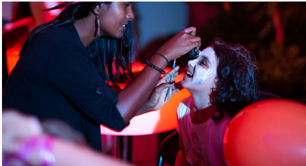
Halloween fun at Kandima Maldives