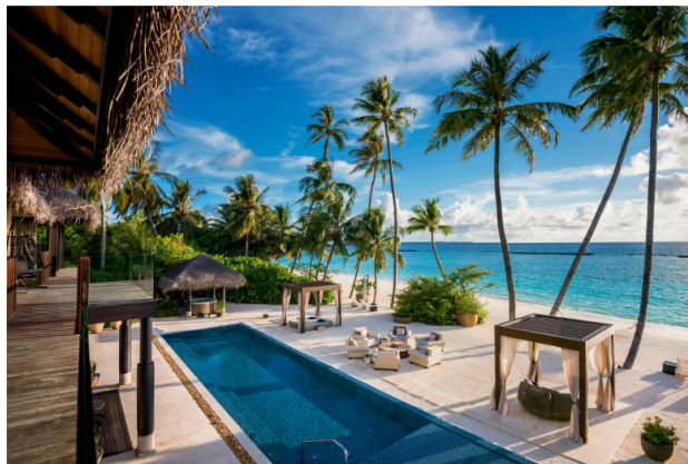
Velaa Private Island