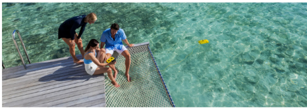
Ritz-Carlton Maldives Resort and Spa