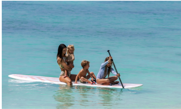
JW Marriott Maldives Resort and Spa