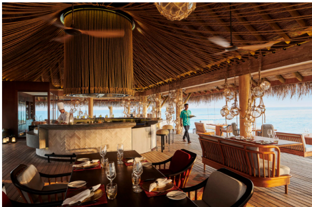
Fairmont Sirru Fen Fushi