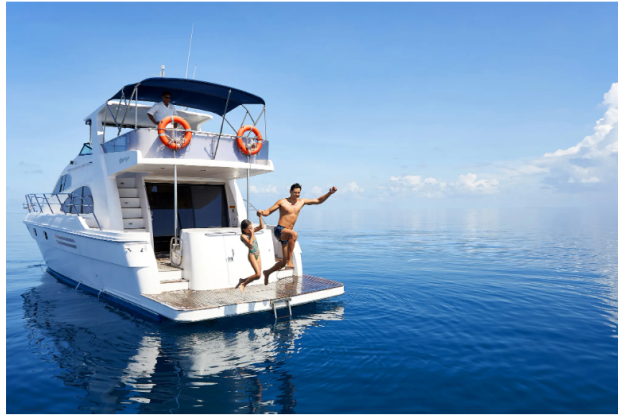
Conrad Maldives Rangali Island offers boat trips