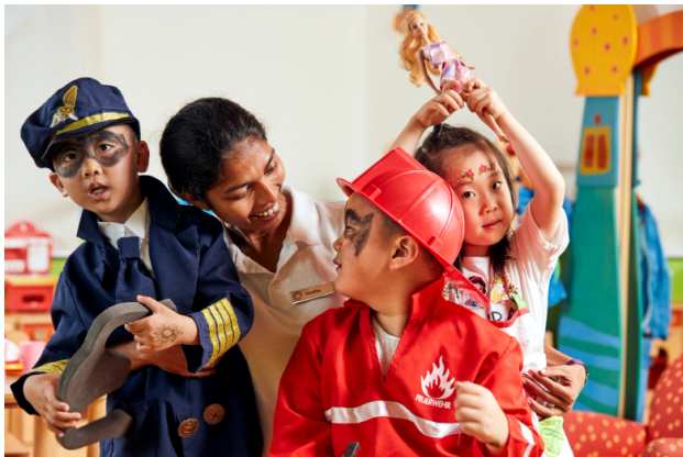
Sun Siyam Iru Fushi