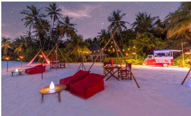
Niyama Private Island