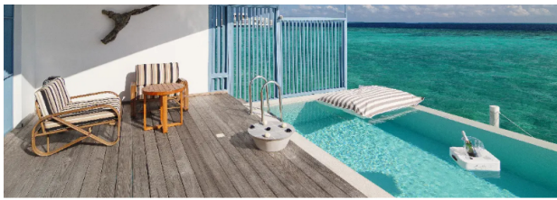
Amilla Maldives Resort & Residences